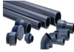
CPVC & UPVC