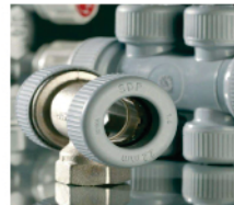
PE - RT