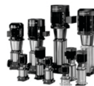
High Pressure Pumps